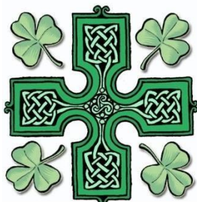
McGeary's Irish Pub